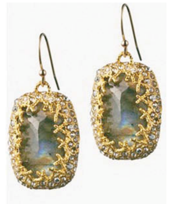
Inspired by Baroque tapestries, Alexis Bittar's gold labradorite Siyabona Cushion Earrings ($216) are encased in a gold vine and dusted with Swarovski crystals. SHE, Bloomfield Hills (248-594-8181; shebloomfield.com ).