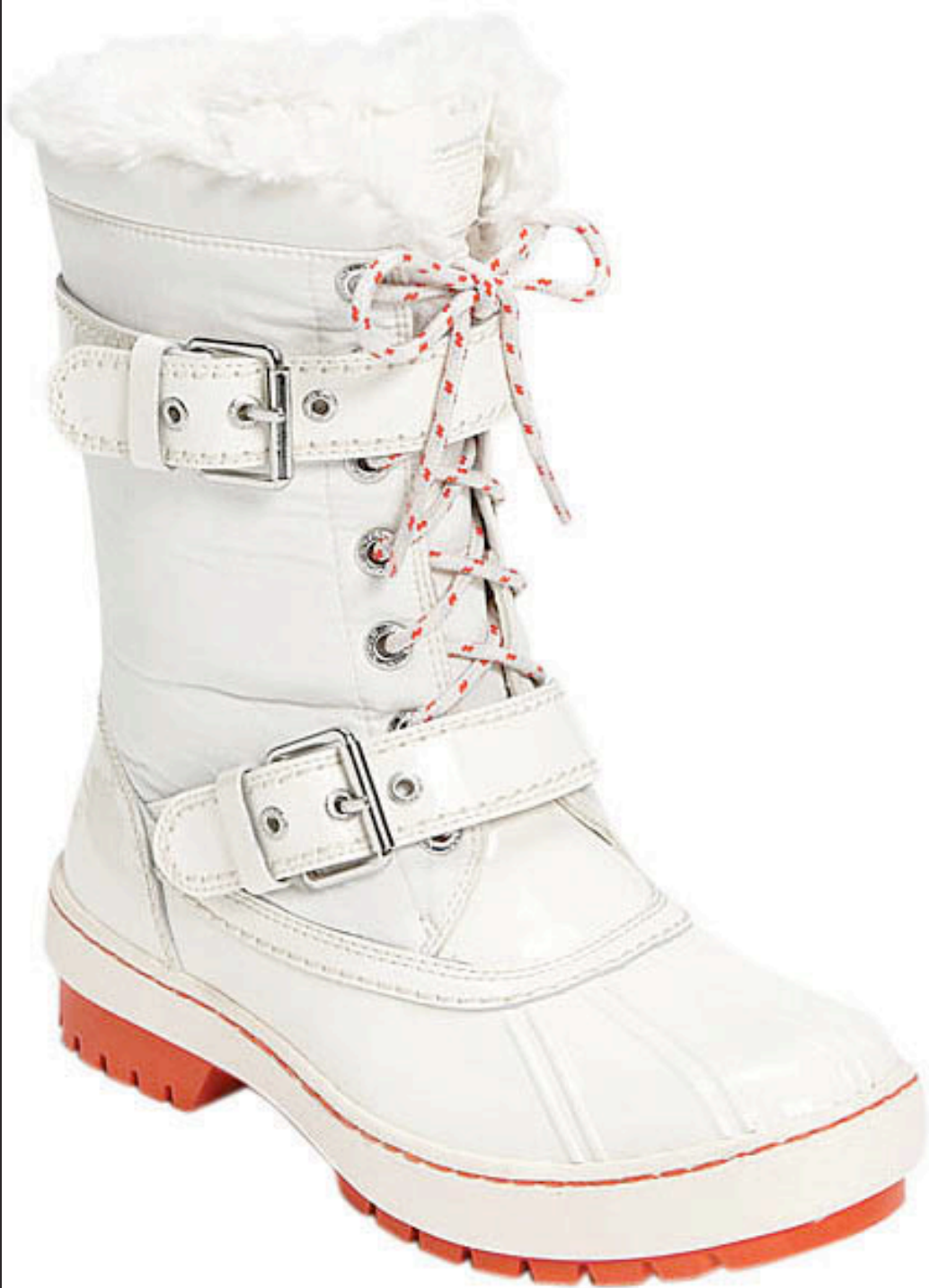
These rugged yet feminine and all-around super cool and toasty Sperry Top-Sider Alpine Boots ($169.95) are Thinsulate-lined for waterproof warmth. Area Nordstrom stores ( nordstrom.com ).