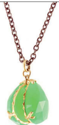
Give her a kiss that can linger: My House of Style's Kiss Necklace ($925) is crafted of 14-karat yellow gold and stunning green chalcedony. My House of Style, Birmingham (248-594-7776; myhouseofstyle.com ).